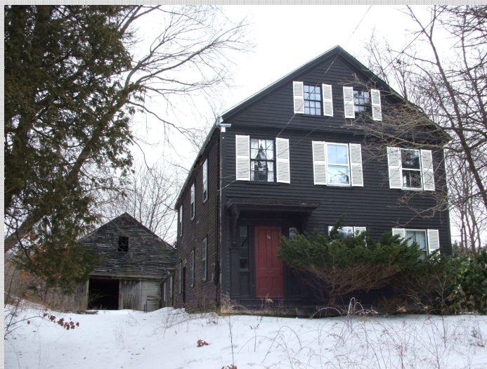
94 Elm St. Georgetown