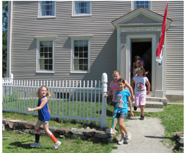
A continuous stream of 3rd graders experience the 1668 Brocklebank Museum