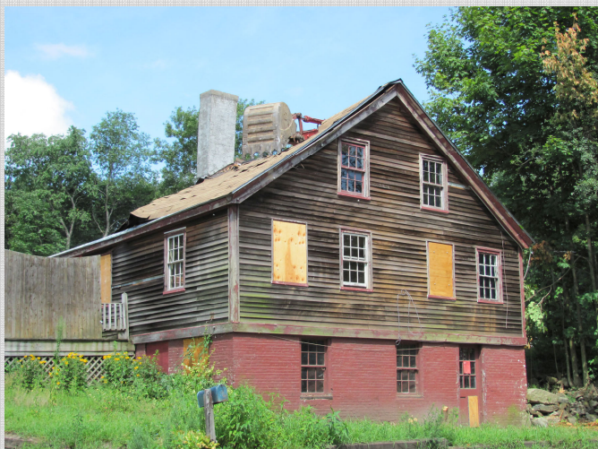
143 Main St. Georgetown

Several homes and historical structures are being demolished deliberately or due to neglect.