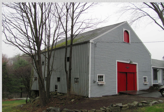
Barn 185 West Main St. Georgetown