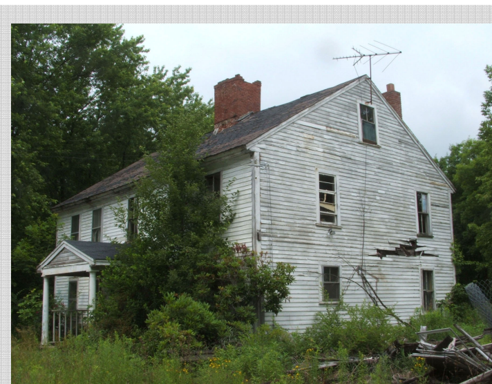
West St. Georgetown