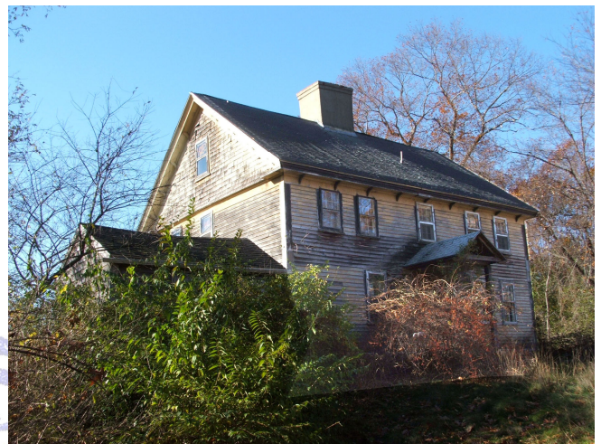
Parish Rd House, Georgetown, MA

One way in which we could help memorialize these places would be, in addition to documenting them with photos and drawings of floor plans, etc. would be to do a