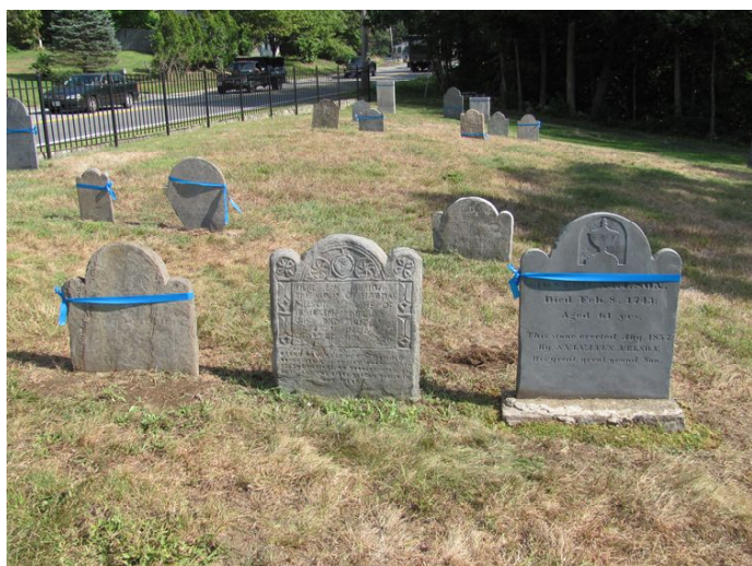
Three stones conserved in project phases 1 & 2.