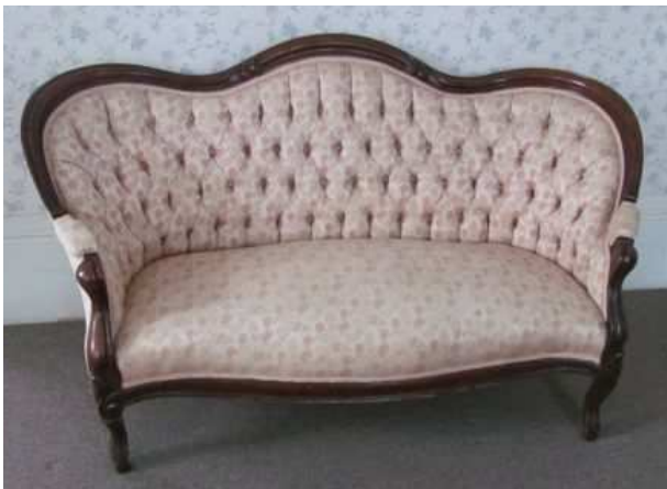
Victorian Love Seat, circa 1870, walnut. $450 and matching chairs $175 (with arms) $150 (ladies chair)

GHS was contacted recently by the Trustees of the Carleton Home on Andover Street to see if we were interested in any of the remaining furnishings before the historic house was sold. We happily accepted an antique tall clock and four Hitchcock chairs for the museum. We were also given permission to take other furniture to sell for the benefit of the Georgetown Historical Society. The beautiful pieces below are in need of a good home.