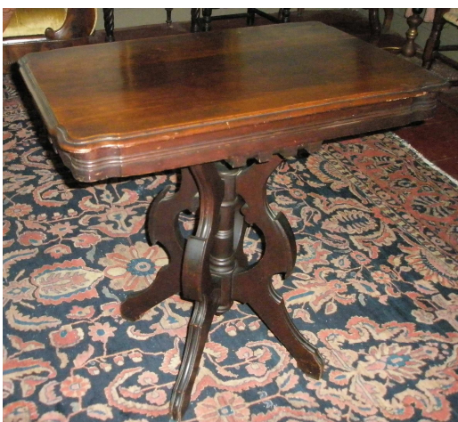
Victorian table, circa 1880, $125