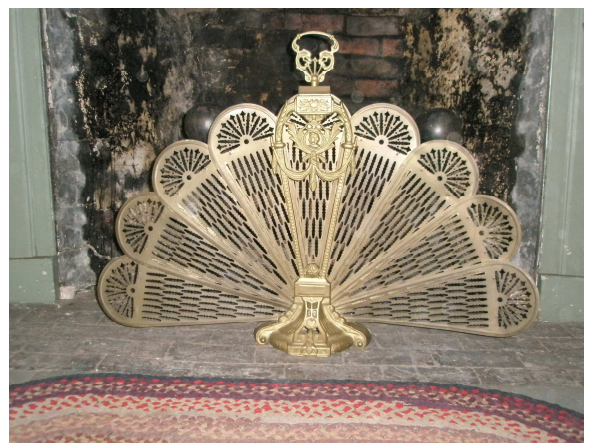
Brass fireplace fan $85