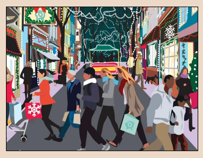
HOLIDAY ON MAIN SATURDAY, DECEMBER 7^{th} , 10:00 - 5:00 p.m.

This event will take place from 10:00 a.m. until 5:00 p.m. Each participant will have a raffle card to be stamped as each of you visits a business indicated on a map of the downtown area. If you get six stamps, you will be eligible to win the basic raffle. If you get nine stamps, that makes you eligible to enter a raffle basket with even more prizes.