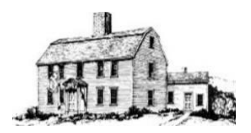
Georgetown Historical Society P.O. Box 376 Georgetown, MA 01833