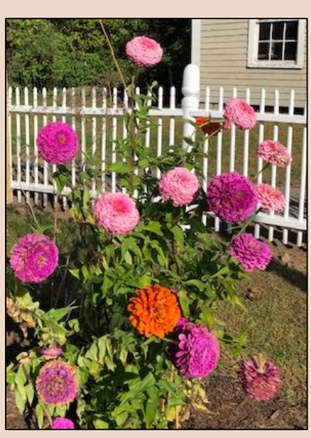
The Front Yard Garden

Perhaps you saw some vibrant colors while passing the museum this summer — we are proud to say that the efforts of our Grounds Beautification Committee have, quite literally, bloomed this year. A new vision for the grounds at the museum began in 2017 with the renovation of our flagpole garden, dedicated to the memory of Dale West, a longtime supporter of the historical society. Weeds that were choking back the flowers were removed, and some new additions were carefully planted. Flagstones were placed to create a walkway so the flag could be raised and lowered without stepping on any flowers. Today, the flagpole garden consists of yellow and orange day lilies, bunches of deep blue iris, black-eyed Susans, daisies, sedum, and more.