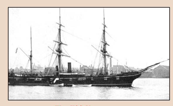
The USS Kearsarge

came off and the entire flag fluttered out of the frame to the floor. It was huge and tattered, and the small notation on the wall said that it had hung on the U.S.S. Kearsarge, the worthy Union ship made famous during the Civil War. I wondered why we were not displaying the flag more prominently, and so began my journey to discover the story behind the flag.